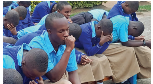
They may be part of a large group, but each student's decision is personal

There is, of course, no way to predict how a year will turn out. There are just too many unforeseen factors involved. But as we embarked upon 2023, we asked God to once again give us at least a million souls per month. Well, to the praise of HIS glory, HE did just that! Over the course of the year, He enabled the teams to conduct an amazing 16,736 evangelistic events. They preached the Gospel to an average of 36,500 people PER DAY. The final number who prayed to receive Jesus in their heart was 13,349,071.