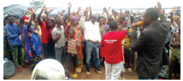
Burundi team member preaching the Gospel at an open-air market

over the past three years, I was amazed to see that the WGTT teams conducted 46,600 events and saw 35.5 MILLION people respond to the Gospel! Needless to say, I found that to be VERY encouraging and motivational to press on, believing God by faith for further expansion of His Kingdom. Since we began this work in 1977, we have seen 60 million people pray to receive Christ. But that is a VERY small number compared to those who still need the Gospel. Therefore, we are working hard to expand the scope of the ministry as fast as possible.