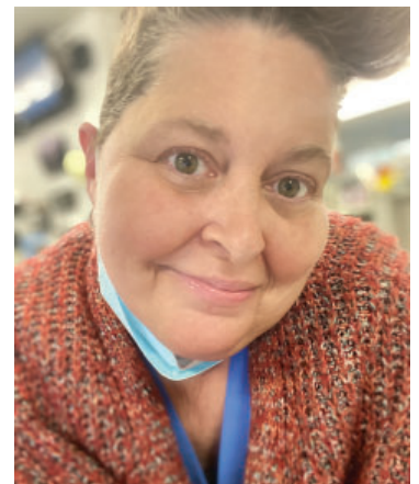
Beautiful till the very end