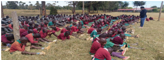
Marion Vero shares the gospel with middle school students in western Kenya

We are planning, over the next few weeks, to relocate at least 7 team members to establish 7 new stations (evangelism centers of operation) in Kenya and Tanzania. Once a new station is established with a trained