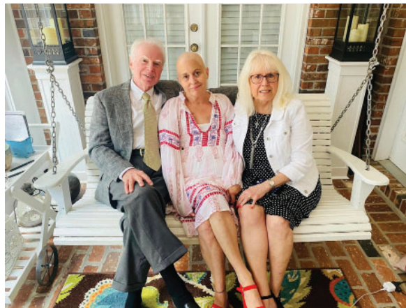
Our still beautiful girl while she was doing chemo