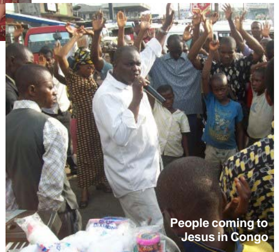
People coming to Jesus in Congo