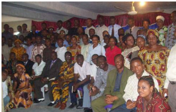
Nigerian pastors learning field evangelism