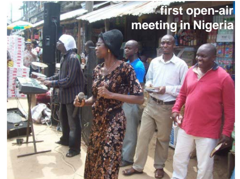
first open-air meeting in Nigeria