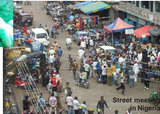
Street meeting in Nigeria