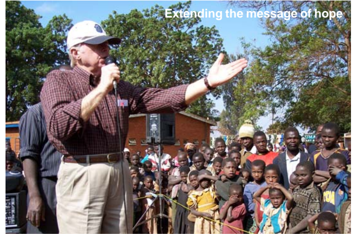
Extending the message of hope

car battery. With that limited “equipment”, however, Lauden sees an average of 3000 to 5000 people saved every month, even in the rainy seasons. That is what I call victory in the battle for souls.