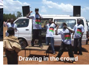
Drawing in the crowd

We are excited to see how God uses these men and these ministries in the years to come. If it goes anything like Malawi and Kenya, I am sure it will serve only to enhance the story of victory we have witnessed so far.