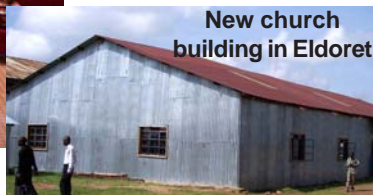
New church building in Eldoret