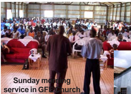
Sunday morning service in GFE church