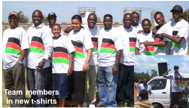
Team members in new t-shirts