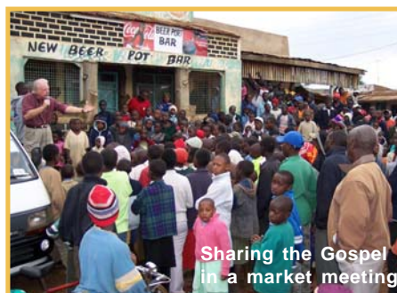
Sharing the Gospel in a market meeting