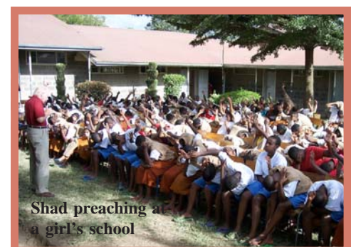
Shad preaching at a girl's school

masses with the only message that can open the eyes of the heart. Thank you for being with us as WE GO TO THEM.