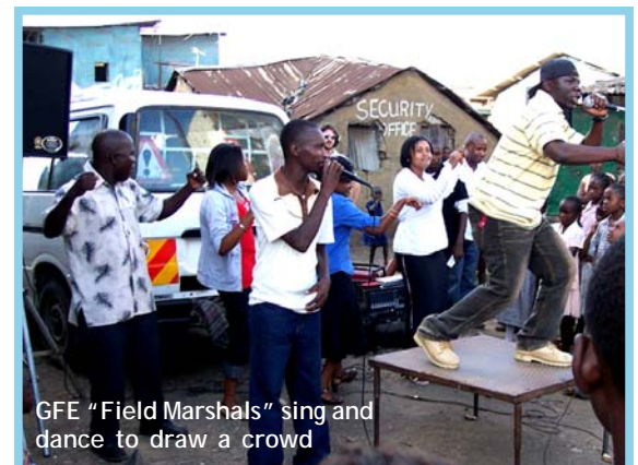
GFE "Field Marshals" sing and dance to draw a crowd

By noon Thursday we were back in Nairobi, and before the day was over another open-air meeting and a film show had been completed in which