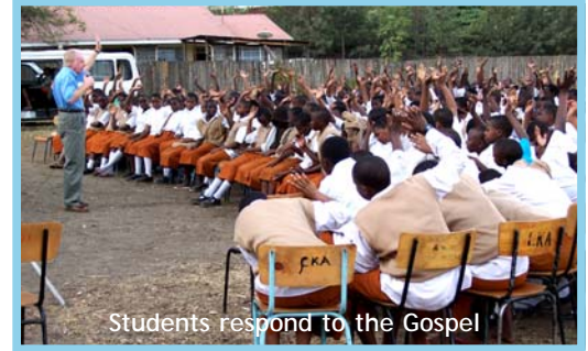
Students respond to the Gospel