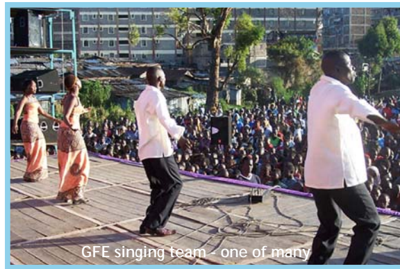
GFE singing team one of many

The crowds grew on the second and third nights with responses on both nights exceeding the first. Then on the final night the ground was so packed that it looked as if it could not contain another person. In the final service over 11,500 people responded, bringing the project total to 85,040 decisions for Jesus. Truly God had turned that ground into a place of redemption. Many tribes were represented in that huge crowd, tribes that were at war and were killing each other just a year ago. Now on this final night they were shaking hands, welcoming each other into the family of God, smiling, embracing and rejoicing together in belonging to the great tribe of heaven, the eternal family of God. As the sun sank below the horizon I shouted to the audience, “The sun is going down, but the Son of God has arisen in your hearts!” At that the crowd cheered and applauded in agreement. Sitting here now in my office at home I can still hear those cheers and I can still see those faces. And I must tell you, those are the most beautiful sights and sounds I have ever seen – the sights and sounds of the transforming love of God. Amazing, absolutely amazing!